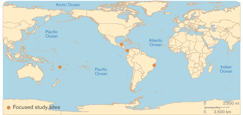
Of the four countries with MMAs, 6 study sites were in Belize, 3 study sites were in Brazil, 9 study sites were in Fiji, and 1 study site was in Panama.

Currently existing indigenous peoples, often overlooked in socioeconomic research, from four countries with marine managed areas (MMAs)—Belize, Brazil, Fiji, and Panama—were selected as case studies. Three points in the cross-country analyses present themselves: 1) there is a wealth of traditional knowledge that guides customary practices which needs to be identified and integrated into the formal regime of MMAs; 2) there is an overlap between indigenous peoples and others who have lived close by for generations and shared extensively in marine resource use, thus creating an amalgam of traditional cultures; and 3) there is a growing awareness by nation-states to integrate into their own emerging national cultures the beliefs and practices found among indigenous peoples and others who share traditional cultures.